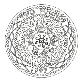
£2 Two Pounds