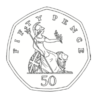
50p Fifty Pence