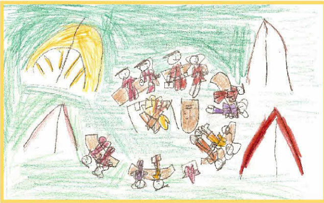
The log circle - our favourite place!

There are four classes currently in the school. All the classes are named after wild plants to reflect our school's ongoing commitment to outdoor learning. Throughout the school there is a strong emphasis on active learning with all classes learning through hands on experiences, with carefully planned holistic, thought provoking activities. Each class has its own Clevertouch TV screens which the children use to enhance their learning in all areas of the curriculum.